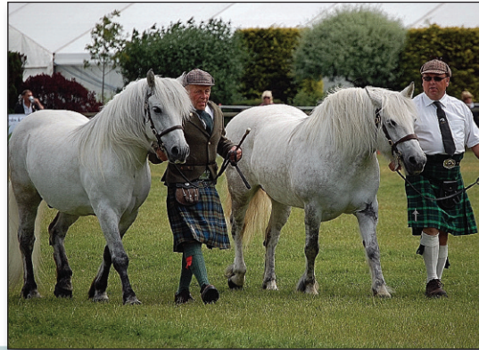
A traditional turnout at the RHS.