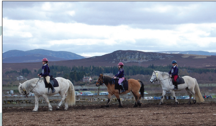
Right: Child riders on the Ormiston ponies at Newtonmore with the snow-speckled Cairngorms as a backdrop.