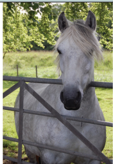
A real Highland beauty.