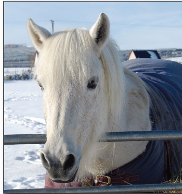
Mansfield Mariandle in the snow.