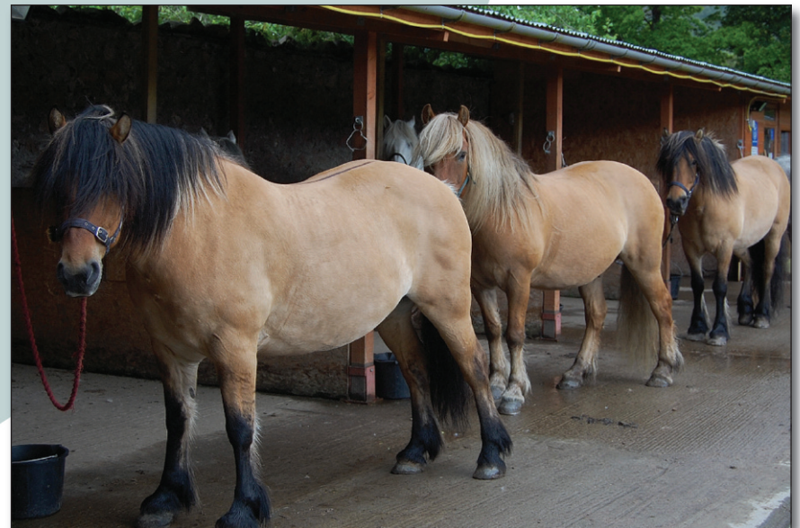
Line up of dun ponies.