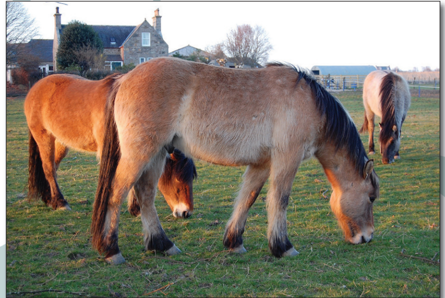
Three friends. Cairns Garlinebeg with Scaraben of Auchincrive behind and the handreared Cairns Guireaman to the right.