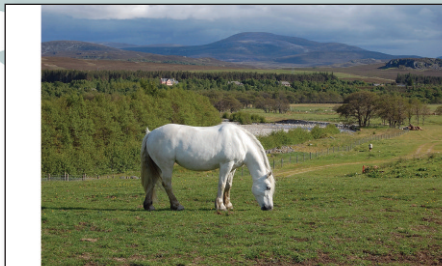
A Highland pony grazes near Newtonmore at the foot of the Cairngorm range of mountains.